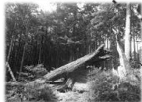
Several years ago, the big tree of Quercus standing on the pass had fallen.

Una-Zawa-Zuido (Tunnel) Una-Zawa-Rindo [forest road] starts here. Attention on car driving to O-Nara-Toge [Pass]